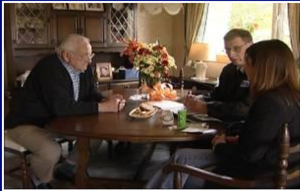
Initial home visit