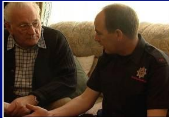
Follow up visits