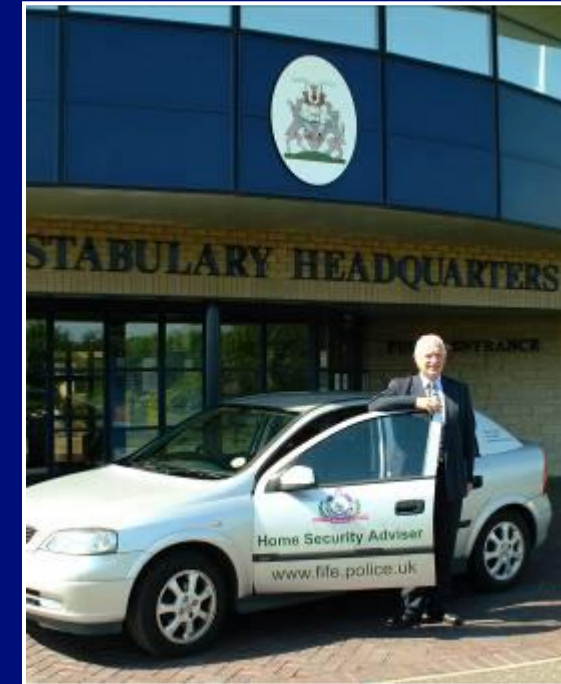
Home safety/security assessment undertaken

No form filling, no waiting list and no cost to client